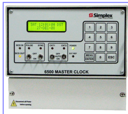
6500-2320 Master Clock