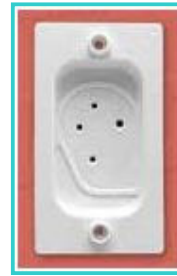
Clipsal 408/4 4Pin Clock Point Socket

The recommended installation uses a Clipsal 408/4 4Pin Clock Point recessed Socket to receive the Clipsal 409/4 Pin plug fitted to the clock.