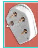
Clipsal 409/4 4 Pin Plug